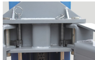
Automatic arm lock