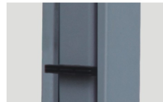
Door opening protection rubber