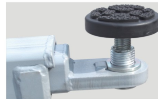
Pick up tray